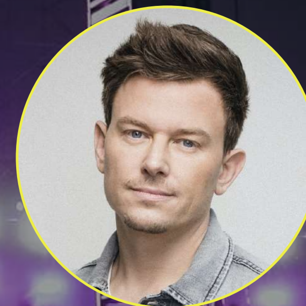
Fedde Le Grand