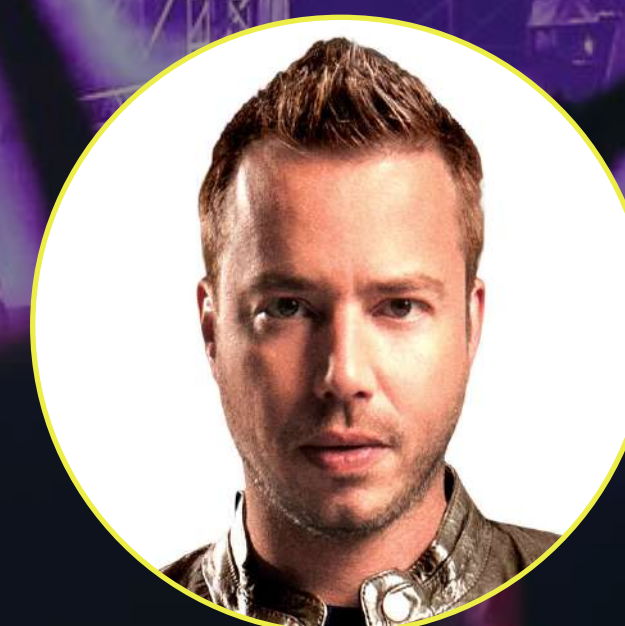
Sander Van Doorn