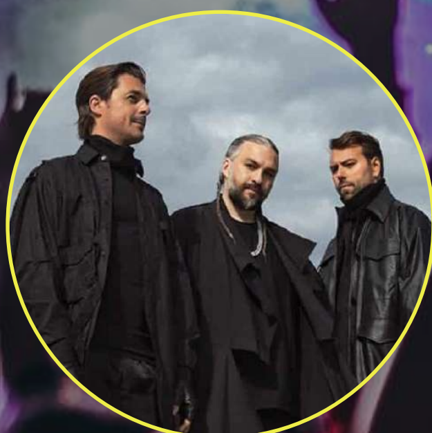
Swedish House Mafia